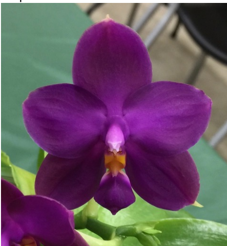
Phal. Yaphon Red Pearl 'Arnie' AM/AOS