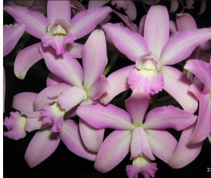
Cattleya Tanya Lam 'Bud Segraves' HCC/AOS