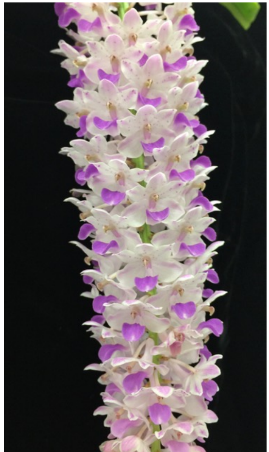
Rhynchostylis retusa 'Charlie' AM/AOS