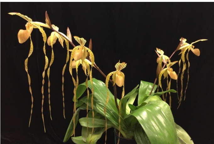
Paph. Kolosand 'Bravo Orchids' AM/AOS