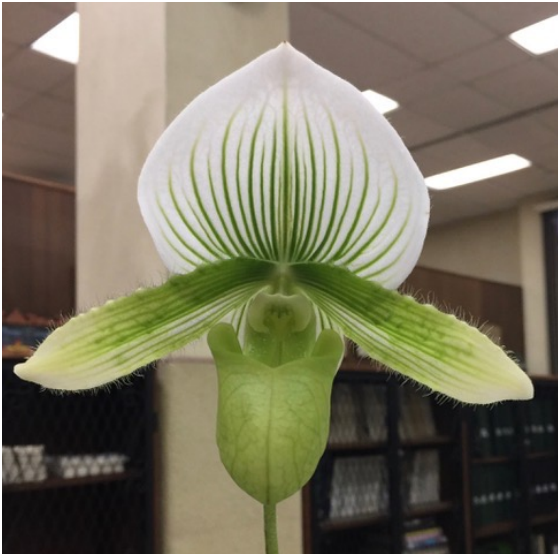
Paph. (Hilo Mojito x Hilo Key Lime) 'Bravo Orchids' FCC/AOS