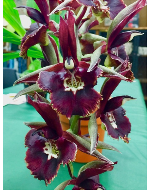
Ctsm. Lata Laxman 'Tyrone' AM/AOS Ctsm. Lata Laxman 'Tyrone' AM/AOS